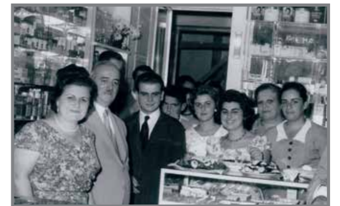
N.P. Gerolymatos new pharmacy inauguration, Athens 1956